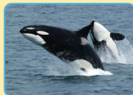
Whorries (Orca)

Orcas are one of the fiercest predators in the sea. They eat seals, sea lions, penguins, squid, sea turtles, whales and even sharks. They have a thick layer of blubber to protect them from the cold water.