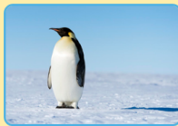
Emperor Penguin

Emperor penguins are the biggest penguins in the world. They have a special flap of skin above their feet where they keep their egg (and then their chicks) warm and off of the cold ground.